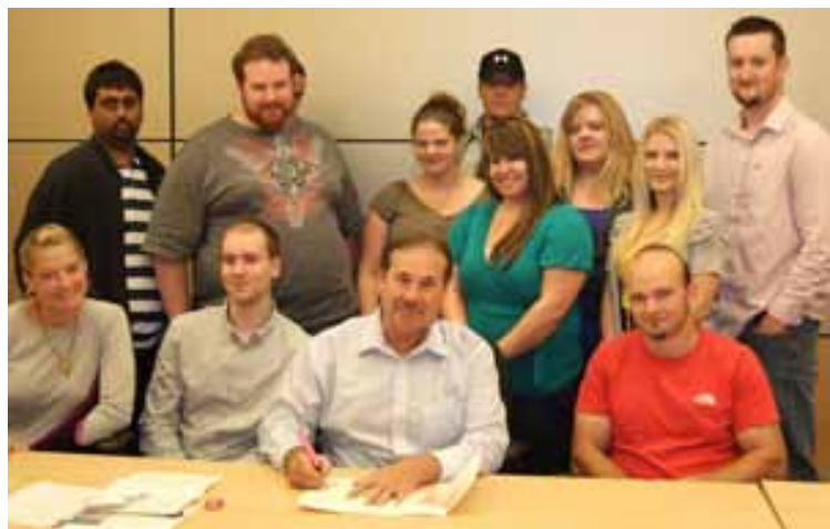
BCGEU Young Worker Committee meeting in October 2010

I feel privileged and honoured to be a part of this committee especially as a component 10 representative. I look forward to continuing to meet with the committee and work towards making a difference for young workers.