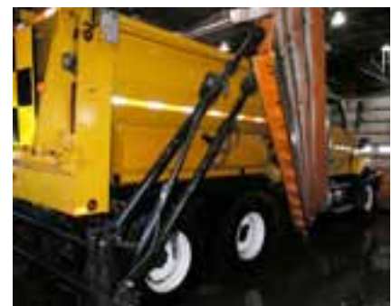
The box and wing attachments on this truck were fabricated by SGEU members in their welding fabricating shop in Regina, SK.

The week in Saskatchewan was well received, and appears to have had a positive impact. Our brothers and sisters in Saskatchewan also report that the response to the SGEU campaign on privatization has been very positive.